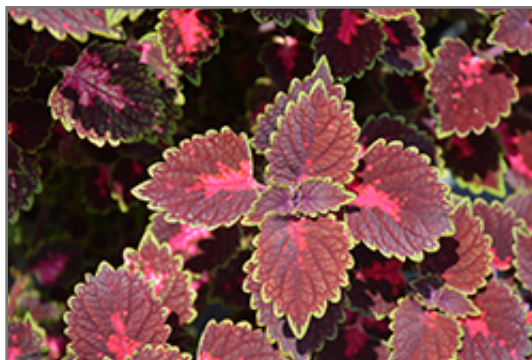
ColorBlaze Cherry Drop Coleus foliage