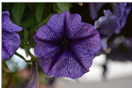
Tea Indigo Vein Petunia flowers