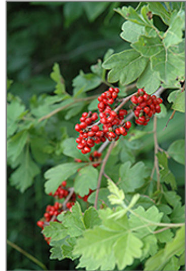
Fragrant Sumac fruit