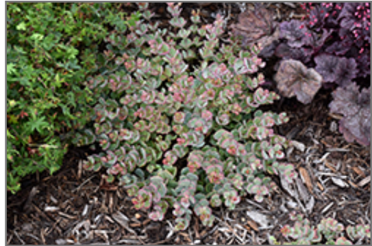
October Daphne