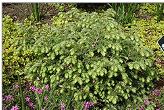
Moon Frost Hemlock