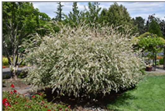
Tricolor Willow