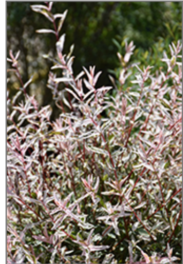
Tricolor Willow foliage

This shrub should only be grown in full sunlight. It is quite adaptable, preferring to grow in average to wet conditions, and will even tolerate some standing water. It is not particular as to soil type or pH. It is highly tolerant of urban pollution and will even thrive in inner city environments. This is a selected variety of a species not originally from North America.