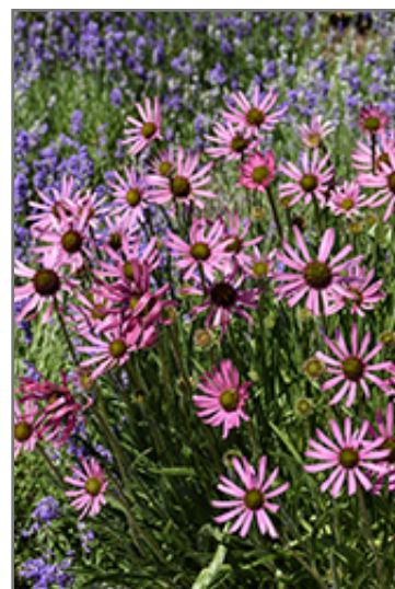
Tennessee Coneflower flowers