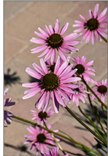
Tennessee Coneflower flowers

Tennessee Coneflower is a fine choice for the garden, but it is also a good selection for planting in outdoor pots and containers. With its upright habit of growth, it is best suited for use as a 'thriller' in the 'spiller-thriller-filler' container combination; plant it near the center of the pot, surrounded by smaller plants and those that spill over the edges. Note that when growing plants in outdoor containers and baskets, they may require more frequent waterings than they would in the yard or garden. Be aware that in our climate, most plants cannot be expected to survive the winter if left in containers outdoors, and this plant is no exception. Contact our experts for more information on how to protect it over the winter months.