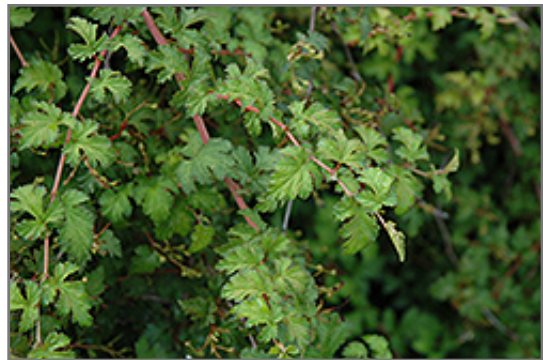
Cutleaf Stephanandra foliage