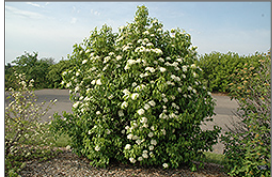
Nannyberry in bloom