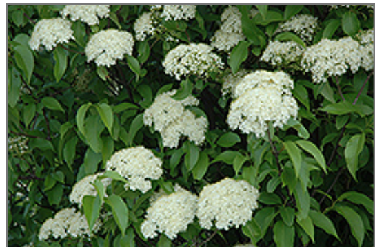
Nannyberry flowers