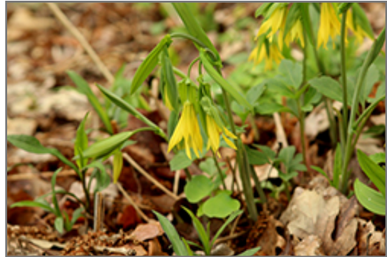
Great Merrybells flowers