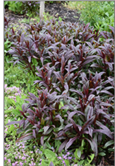
Dark Towers Beard Tongue

Dark Towers Beard Tongue is a fine choice for the garden, but it is also a good selection for planting in outdoor pots and containers. With its upright habit of growth, it is best suited for use as a 'thriller' in the 'spiller-thriller-filler' container combination; plant it near the center of the pot, surrounded by smaller plants and those that spill over the edges. It is even sizeable enough that it can be grown alone in a suitable container. Note that when growing plants in outdoor containers and baskets, they may require more frequent waterings than they would in the yard or garden. Be aware that in our climate, most plants cannot be expected to survive the winter if left in containers outdoors, and this plant is no exception. Contact our experts for more information on how to protect it over the winter months.