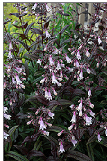
Dark Towers Beard Tongue flowers