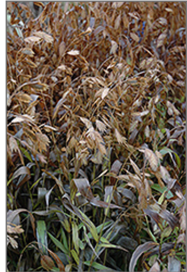
Northern Sea Oats in fall