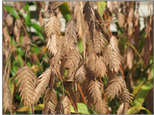
Northern Sea Oats fruit

Northern Sea Oats is a fine choice for the garden, but it is also a good selection for planting in outdoor pots and containers. Because of its height, it is often used as a 'thriller' in the 'spiller-thriller-filler' container combination; plant it near the center of the pot, surrounded by smaller plants and those that spill over the edges. It is even sizeable enough that it can be grown alone in a suitable container. Note that when growing plants in outdoor containers and baskets, they may require more frequent waterings than they would in the yard or garden. Be aware that in our climate, most plants cannot be expected to survive the winter if left in containers outdoors, and this plant is no exception. Contact our experts for more information on how to protect it over the winter months.