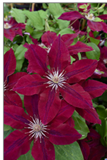
Rebecca Clematis flowers