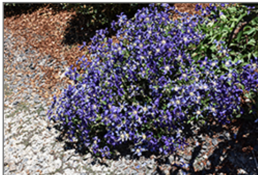
Sapphire Indigo Clematis in bloom