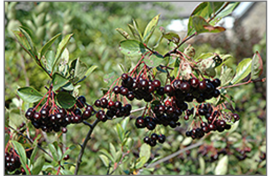
Autumn Magic Black Chokeberry fruit

This shrub should only be grown in full sunlight. It is an amazingly adaptable plant, tolerating both dry conditions and even some standing water. It is not particular as to soil type or pH, and is able to handle environmental salt. It is somewhat tolerant of urban pollution. This is a selection of a native North American species.