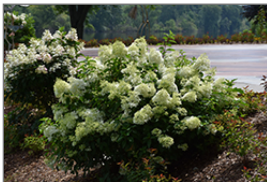
Little Lime Hydrangea in bloom