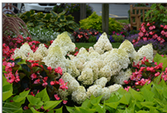
Little Lime Hydrangea flowers