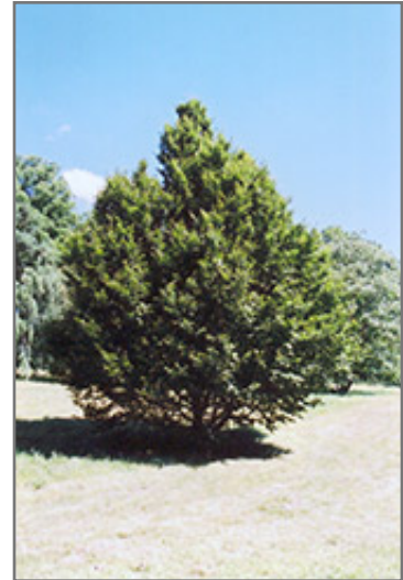
American Hornbeam