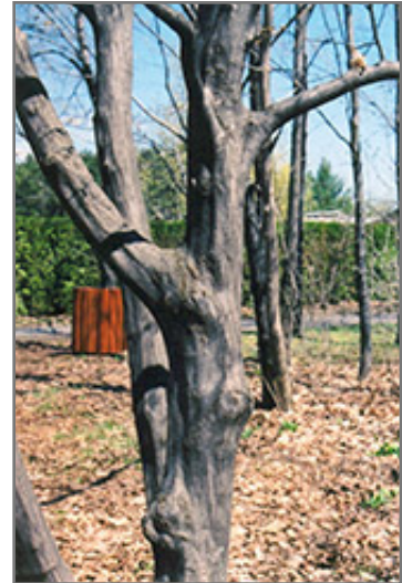
American Hornbeam bark

This tree performs well in both full sun and full shade. It is an amazingly adaptable plant, tolerating both dry conditions and even some standing water. It is not particular as to soil type or pH. It is somewhat tolerant of urban pollution. This species is native to parts of North America.