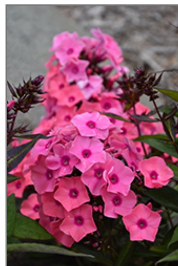
Coral Creme Drop Garden Phlox flowers