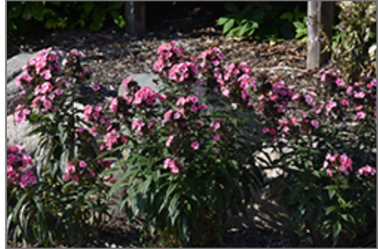
Coral Creme Drop Garden Phlox in bloom

Coral Creme Drop Garden Phlox will grow to be about 18 inches tall at maturity extending to 24 inches tall with the flowers, with a spread of 18 inches. When grown in masses or used as a bedding plant, individual plants should be spaced approximately 15 inches apart. It grows at a medium rate, and under ideal conditions can be expected to live for approximately 10 years. As an herbaceous perennial, this plant will usually die back to the crown each winter, and will regrow from the base each spring. Be careful not to disturb the crown in late winter when it may not be readily seen!