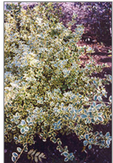
Canadale Gold Wintercreeper