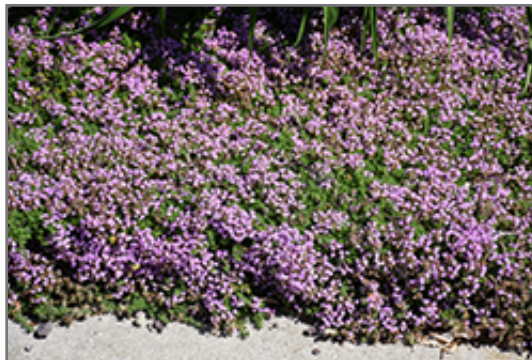
Elfin Creeping Thyme in bloom