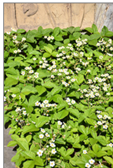
Common Wild Strawberry in bloom

Common Wild Strawberry features dainty white cup-shaped flowers with yellow eyes along the stems from late spring to early summer. Its attractive tomentose round compound leaves remain green in color throughout the season. It features an abundance of magnificent cherry red berries from late spring to late summer.