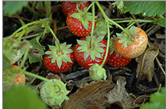
Common Wild Strawberry

Common Wild Strawberry features dainty white cup-shaped flowers with yellow eyes along the stems from late spring to early summer. Its attractive tomentose round compound leaves remain green in color throughout the season. It features an abundance of magnificent cherry red berries from late spring to late summer.