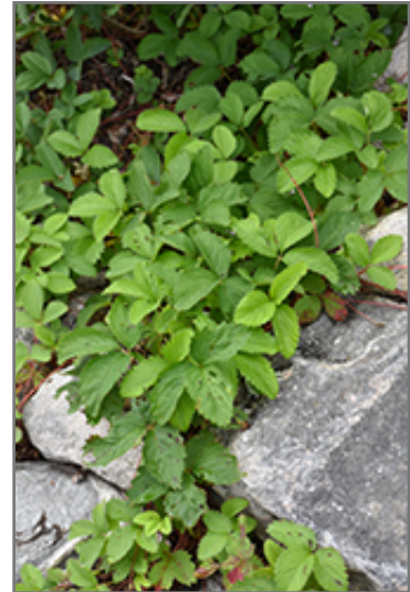
Common Wild Strawberry