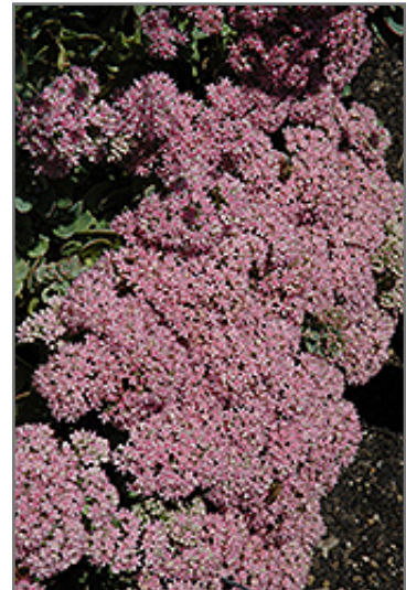
Lime Zinger Stonecrop flowers

Lime Zinger Stonecrop is a dense herbaceous perennial with a ground-hugging habit of growth. Its medium texture blends into the garden, but can always be balanced by a couple of finer or coarser plants for an effective composition.