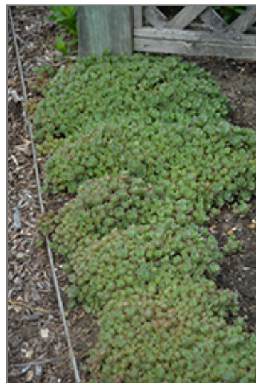
Lime Zinger Stonecrop

Lime Zinger Stonecrop is a fine choice for the garden, but it is also a good selection for planting in outdoor pots and containers. Because of its spreading habit of growth, it is ideally suited for use as a 'spiller' in the 'spiller-thriller-filler' container combination; plant it near the edges where it can spill gracefully over the pot. Note that when growing plants in outdoor containers and baskets, they may require more frequent waterings than they would in the yard or garden.