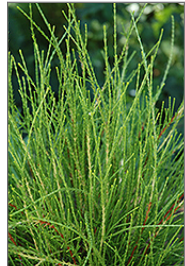
Franky Boy Arborvitae foliage