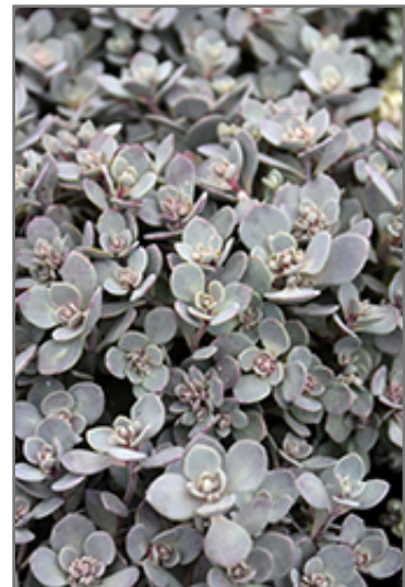
SunSparkler Blue Elf Sedoro foliage

SunSparkler Blue Elf Sedoro is a fine choice for the garden, but it is also a good selection for planting in outdoor pots and containers. Because of its spreading habit of growth, it is ideally suited for use as a 'spiller' in the 'spiller-thriller-filler' container combination; plant it near the edges where it can spill gracefully over the pot. Note that when growing plants in outdoor containers and baskets, they may require more frequent waterings than they would in the yard or garden.