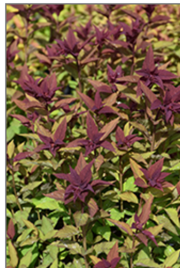
Double Play Doozie Spirea foliage

This shrub should only be grown in full sunlight. It prefers to grow in average to moist conditions, and shouldn't be allowed to dry out. It is not particular as to soil type or pH. It is highly tolerant of urban pollution and will even thrive in inner city environments. This particular variety is an interspecific hybrid.