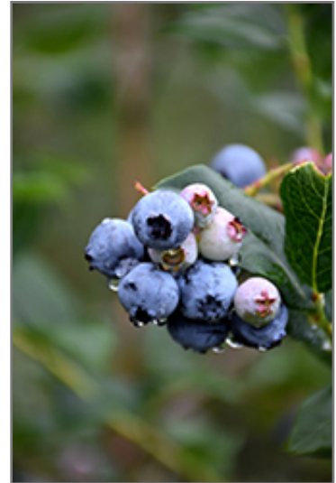
Chippewa Blueberry fruit

This is a multi-stemmed deciduous shrub with an upright spreading habit of growth. Its relatively fine texture sets it apart from other landscape plants with less refined foliage. This is a relatively low maintenance plant, and usually looks its best without pruning, although it will tolerate pruning. It is a good choice for attracting birds to your yard. It has no significant negative characteristics.